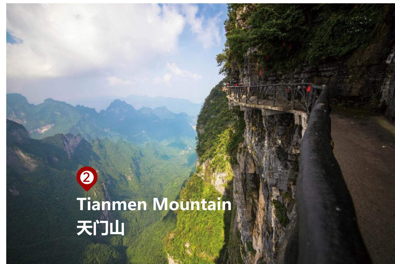
② Tianmen Mountain 天门山