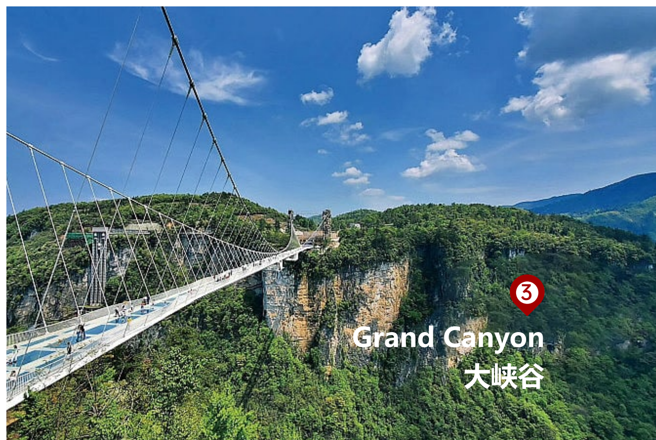
③ Grand Canyon 大峡谷