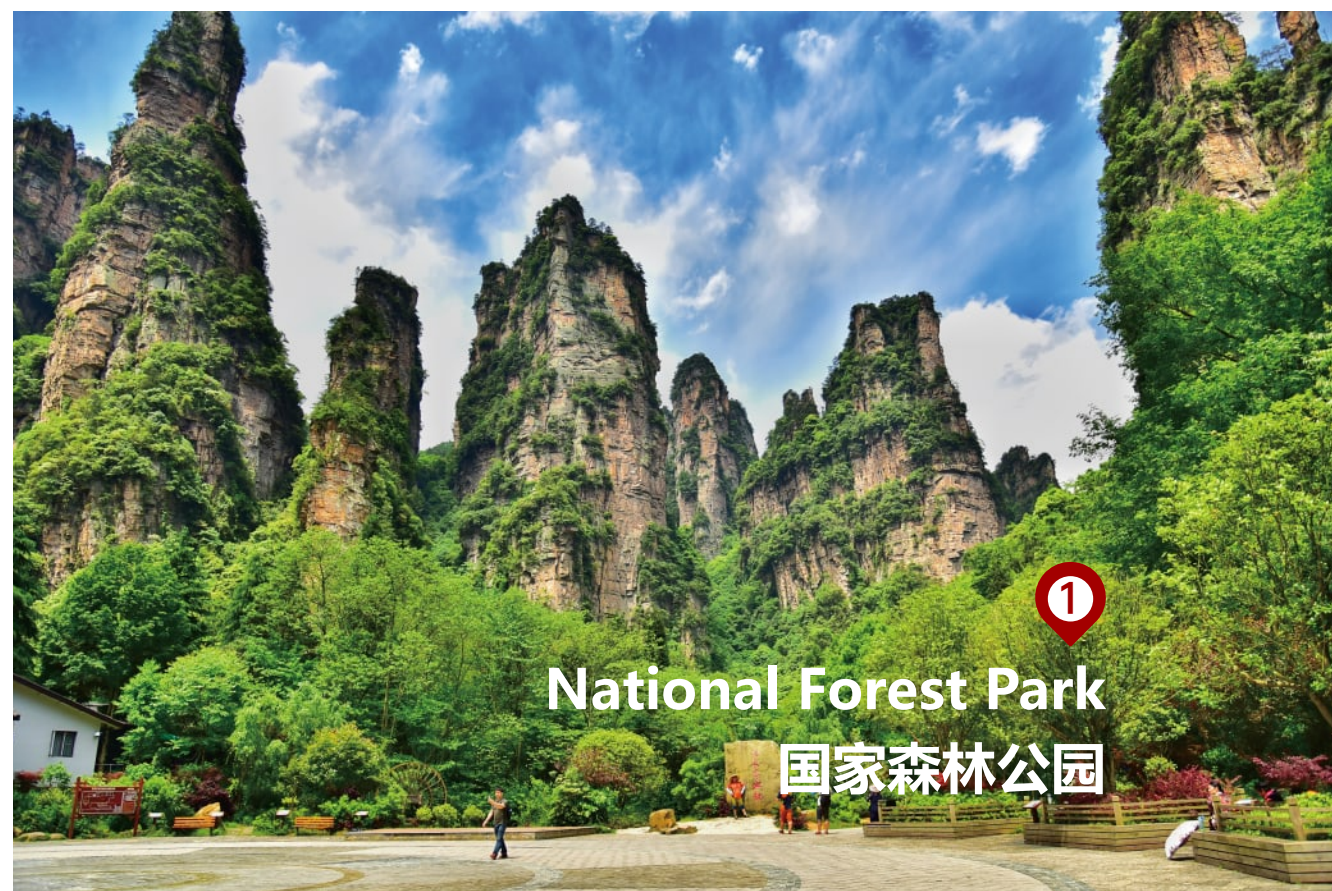
① National Forest Park 国家森林公园