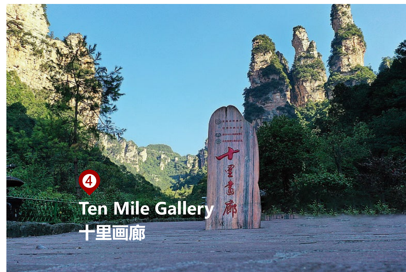
④ Ten Mile Gallery 十里画廊